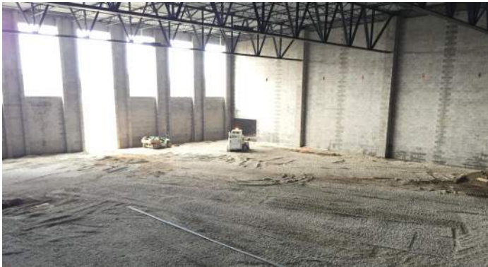
Underground Electrical in Competition Gym