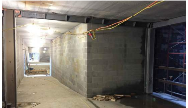
Area B Washington Level