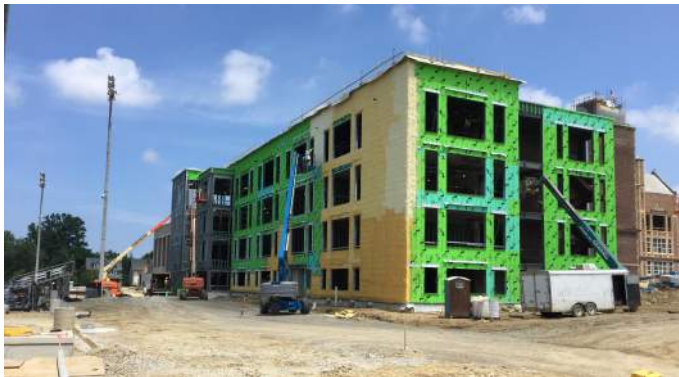
Area A Spray Foam Insulation West Elevation