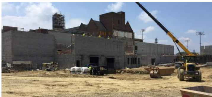
Area D Loading Dock Ramp Excavation