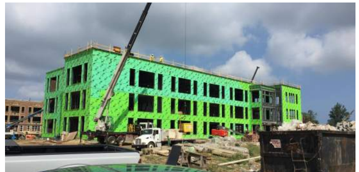
Area F Exterior Sheathing West Elevation